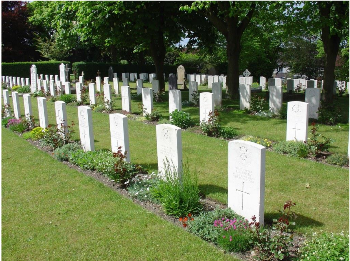
Fort Pitt Military Cemetery, Rochester, Kent