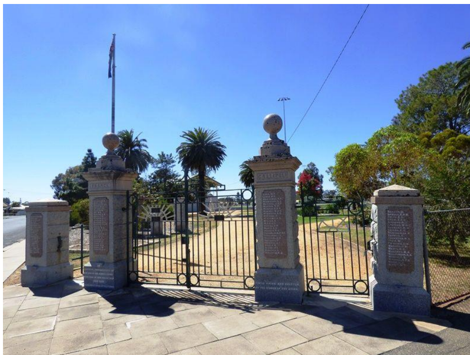
Anzac Park Memorial Gates, Warracknabeal