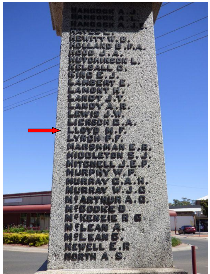
Warracknabeal War Memorial